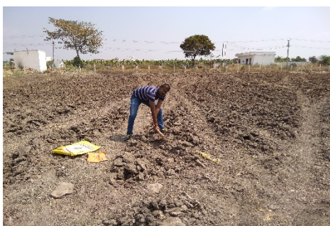
Fig. 3.1 Black Cotton Soil