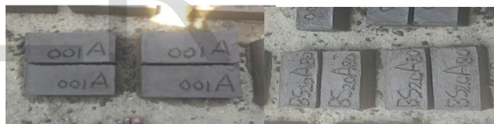
Table 3.1 Details of BSA Brick Specimens Casted

The black cotton soil bricks was manufactured either by using hand mixing method or machine method. In this investigation, all the mixes were mixed by hand mixing method. The semi-solid pastes were checked thoroughly before going for moulding process, because lack of mixing produces low quality bricks. So, special care was given for proper mixing. However, extra addition of water increases the mixing time of the materials.